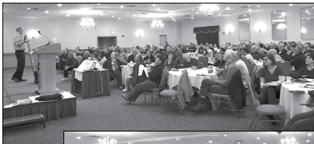
There were a large number of participants at the Branch 34 Retirement Seminar at Florian Hall. Look for another seminar coming up in the near future.