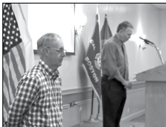
A moment of silence was held prior to the beginning of the Branch 34 Retirement Seminar at Florian Hall.

As we all know, New Year's resolutions are a tradition in which a person makes a promise to do an act of self-improvement. This year, make a resolution to get more involved with Your Union!