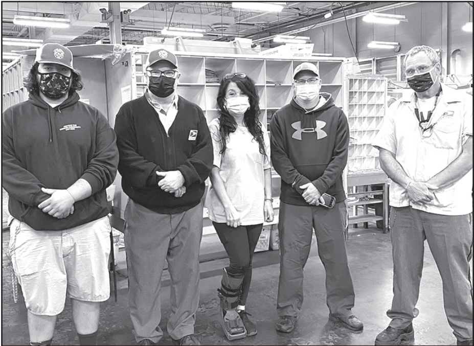
Woburn MDA Letter Carriers Squad.